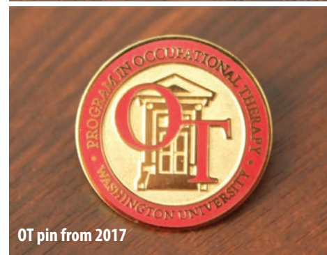
OT pin from 2017