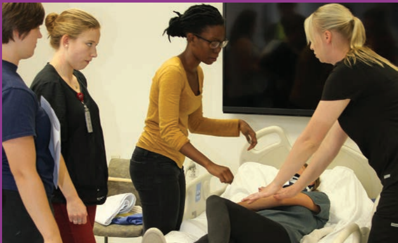
Students learned about transfers in an acute care setting in the Sensorimotor Interventions course on Sept. 7.