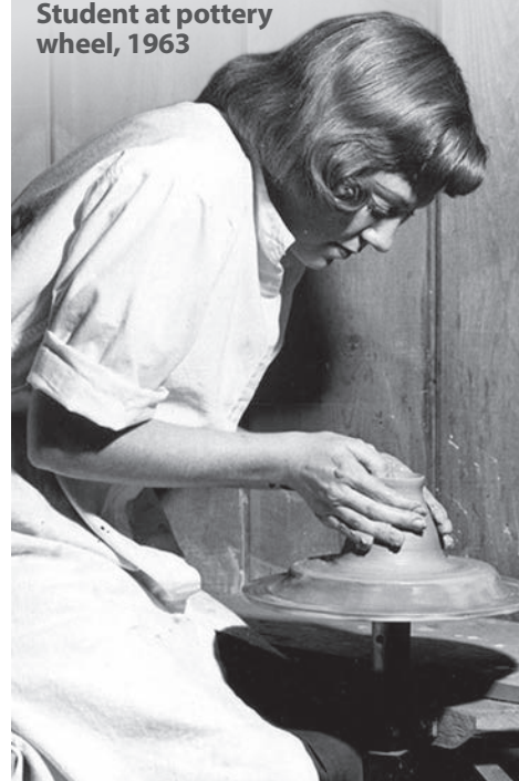
Student at pottery wheel, 1963

Celebrating 100 years of helping people live meaningful lives