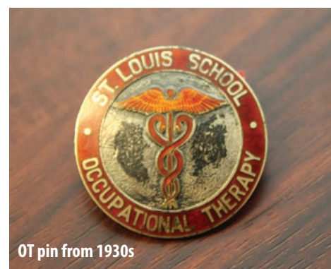
OT pin from 1930s

We look forward to continuing this time-honored tradition with our fall 2018 incoming class next year.