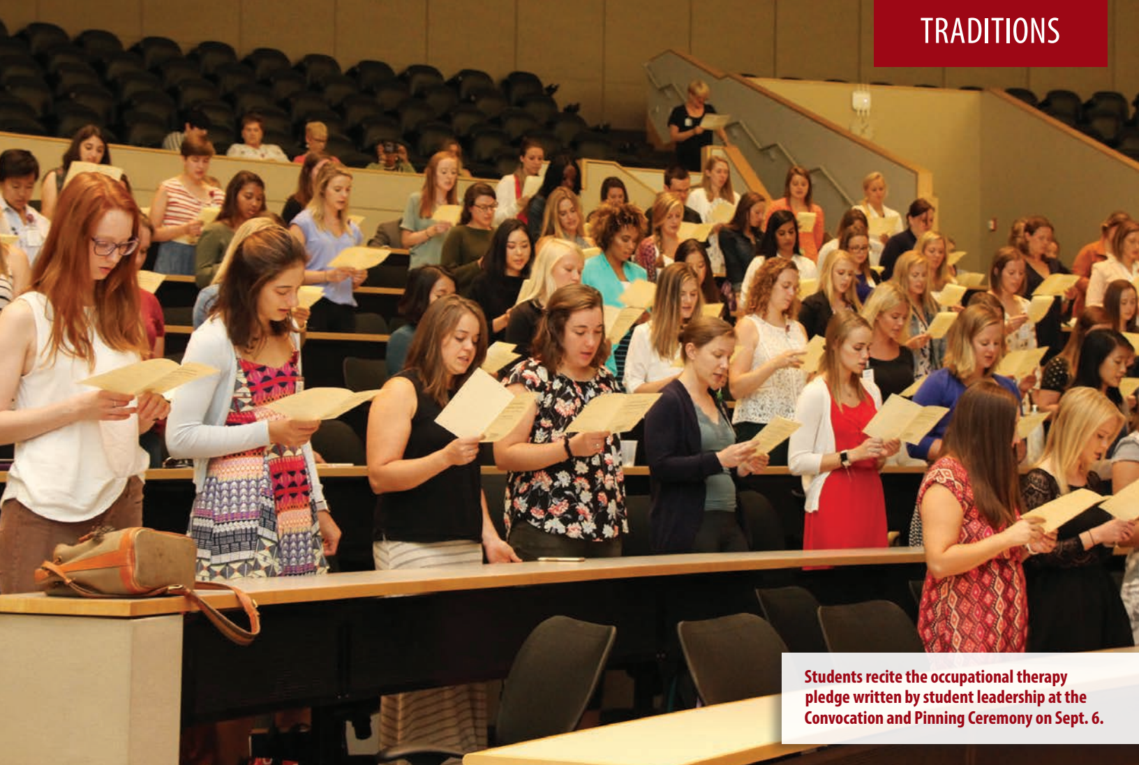
Students recite the occupational therapy pledge written by student leadership at the Convocation and Pinning Ceremony on Sept. 6.